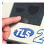
ATG (Automatic Tank Gauging)