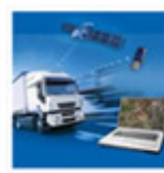
Fleet & Tracking