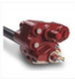
STP (Submersible Turbine Pump)