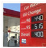
Petrol Station Equipment