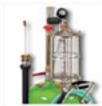
Lube & Oil Equipment