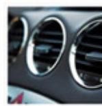
Car Air Condition